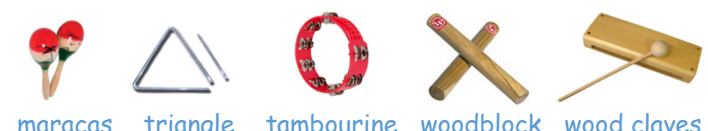
maracas triangle tambourine woodblock wood claves

Untuned instruments play the same sound: