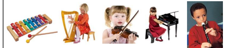
xylophone harp violin piano recorder

Tuned instruments can play different musical notes: